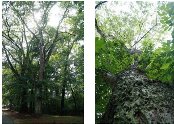
Chatham County American Hackberry Celtis laevigata 237 Points NC State Co-Champs 254 & 261 Points