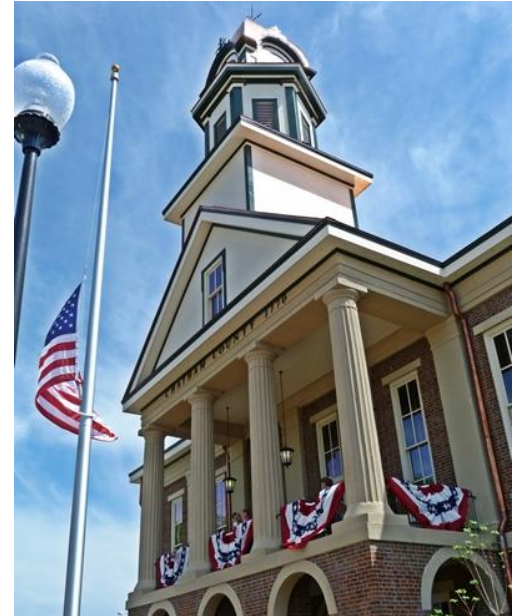
A GRAND REOPENING of the Historic Courthouse on April 20, 2013 proclaimed the return of Chatham's "front porch." See story on page 3.