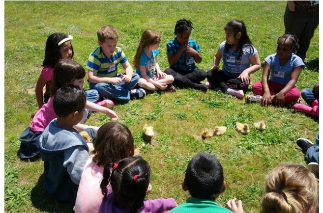
4-H YOUTH & LIVESTOCK: The 4-H program has an established embryology program that brought hands-on learning to 400 students in K-4 classrooms.

The regional partnership includes Central Carolina Community College, Chatham County Schools and the private sector. A Golden LEAF grant provided startup funds. Chatham County's Board of Commissioners is providing $50,000 over two years in matching funds.