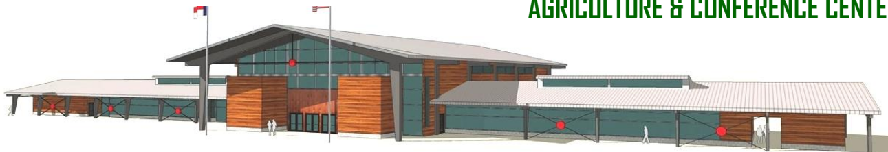
AGRICULTURE & CONFERENCE CENTER

JACK DARK CENTER: The Board of Commissioners voted to name the Backup 911 Center in Siler City in honor of long-time 911 telecommunicator Jack Dark, who passed away unexpectedly on Jan. 3, 2014.